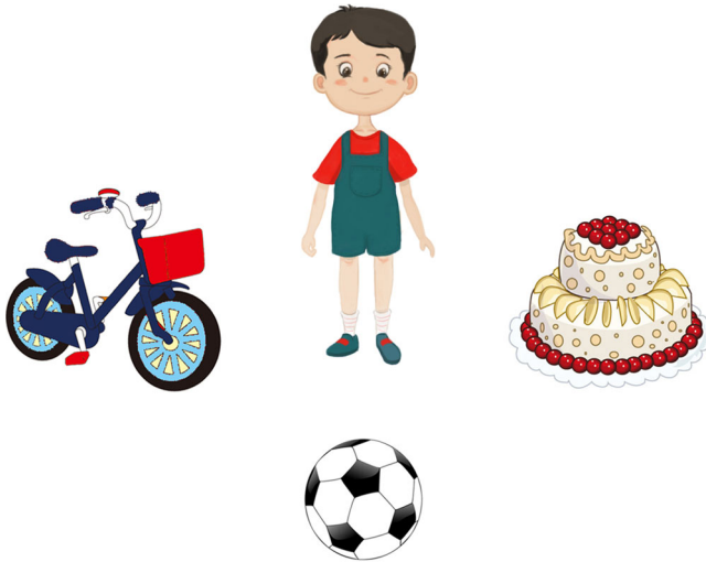
Fig. 1 Example visual image used in the study

To describe one visual image in detail (see Fig. 1): it contained the boy character Kangkang and three objects: a bike, a cake and a ball. For this image, two target sentences were recorded as in (1), one with the verb chi ‘eat’ as in (1a) and one with the verb zhao ‘find’ as in (1b). The verb chi ‘eat’ in (1a) exhibits a clear bias in the selection of objects: it can only take ‘edible’ objects, in this case, the cake in the visual scene. The verb zhao ‘find’ in (1b) is neutral in the selection of objects: it can take any of the three objects in the visual scene. (1a) and (1b) formed minimal pairs. Except for the verbs, the other words in (1a) and (1b) were exactly the same.